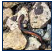
Eastern Red-backed Salamander