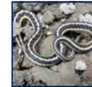
Common Garter Snake