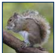
Eastern Grey Squirrel