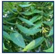
Eastern Black Walnut