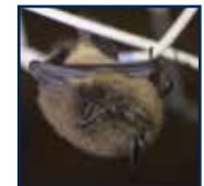
Little Brown Bat