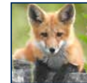
Eastern America Red Fox