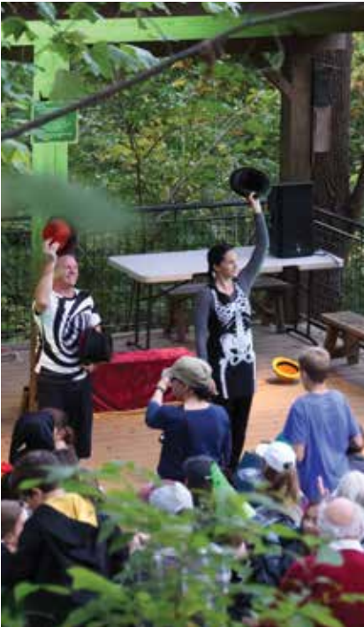
Events are back at Riverbend including beloved community favorite Shiverfest.