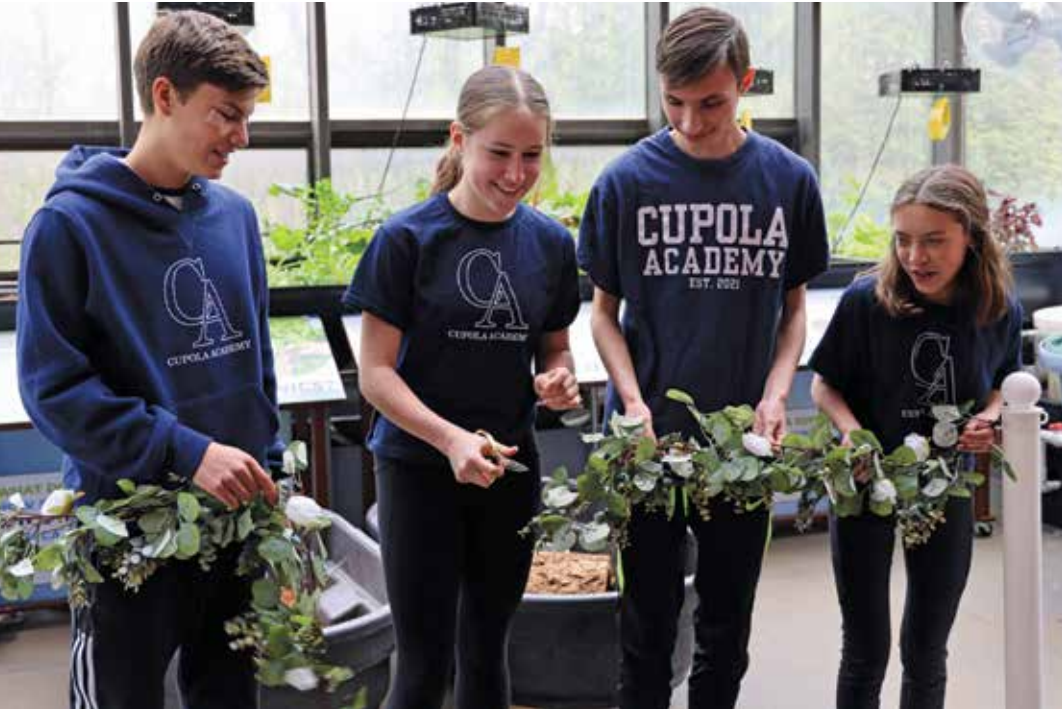
Young learners from Cupola Academy help cut the ribbon at the grand re-opening of Riverbend's aquaponics greenhouse in April 2022.

The Past Year Was a Time of Renewal and Growth at the Preserve and Beyond